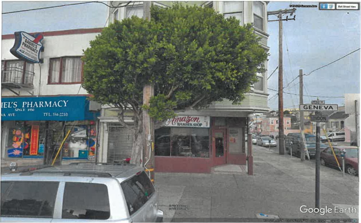
Figure 1: Amazon Barber Shop on the corner of London and Geneva.