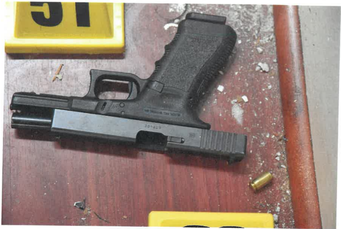
Figure 6: The gun used by Mr. Eid during the incident.