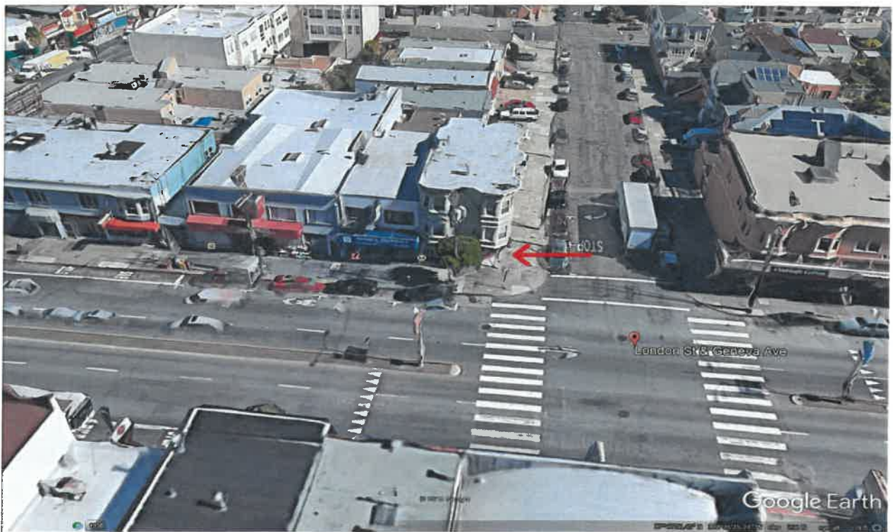
Figure 2: The red arrow indicates the Amazon Barber Shop.