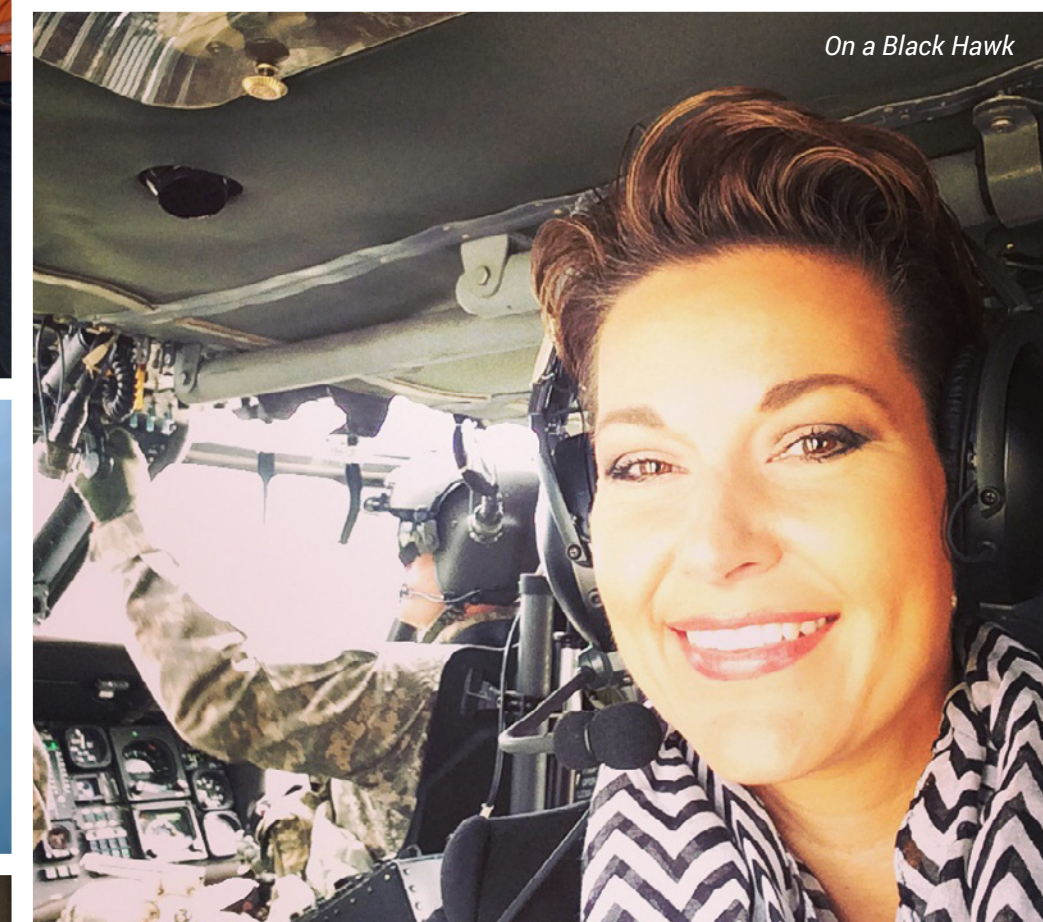
On a Black Hawk