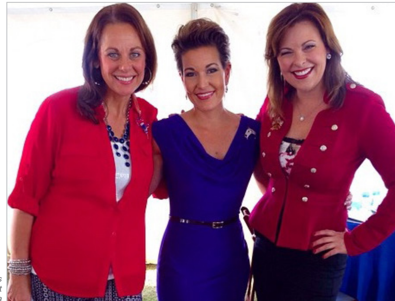
With former Miss Americas at Patriot Plaza