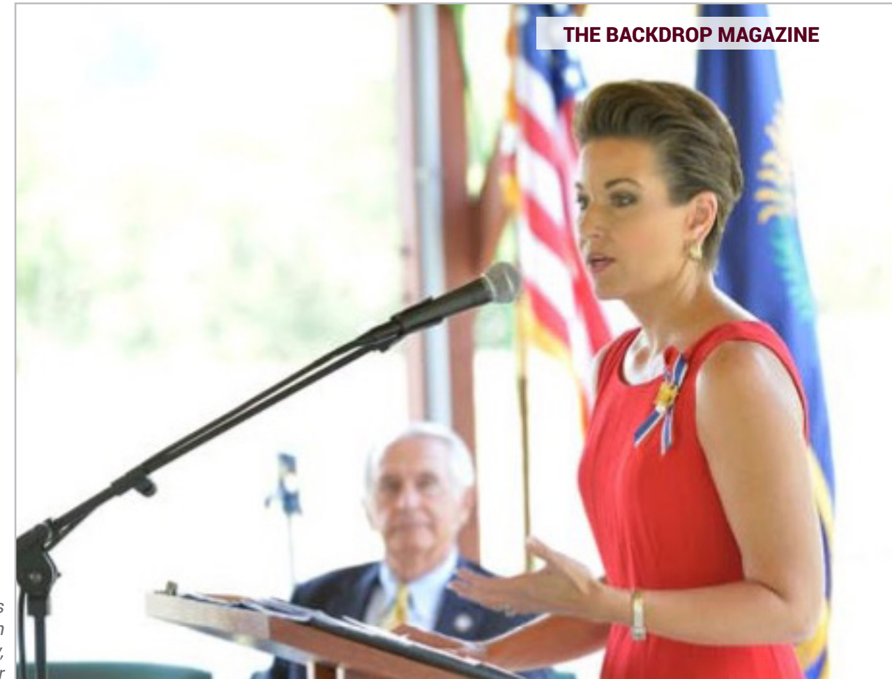
Speaking at press conference with Governor of Kentucky, Steve Beshear

H: Being the Commissioner of the KY Department of Veterans Affairs (KDVA) is the role of a lifetime for me. As Miss America, I championed veterans issues as my national platform and worked on legislative issues that fundamentally changed the way the VA serviced our nations' veterans, and now I get to work more specifically on the veterans population in KY.