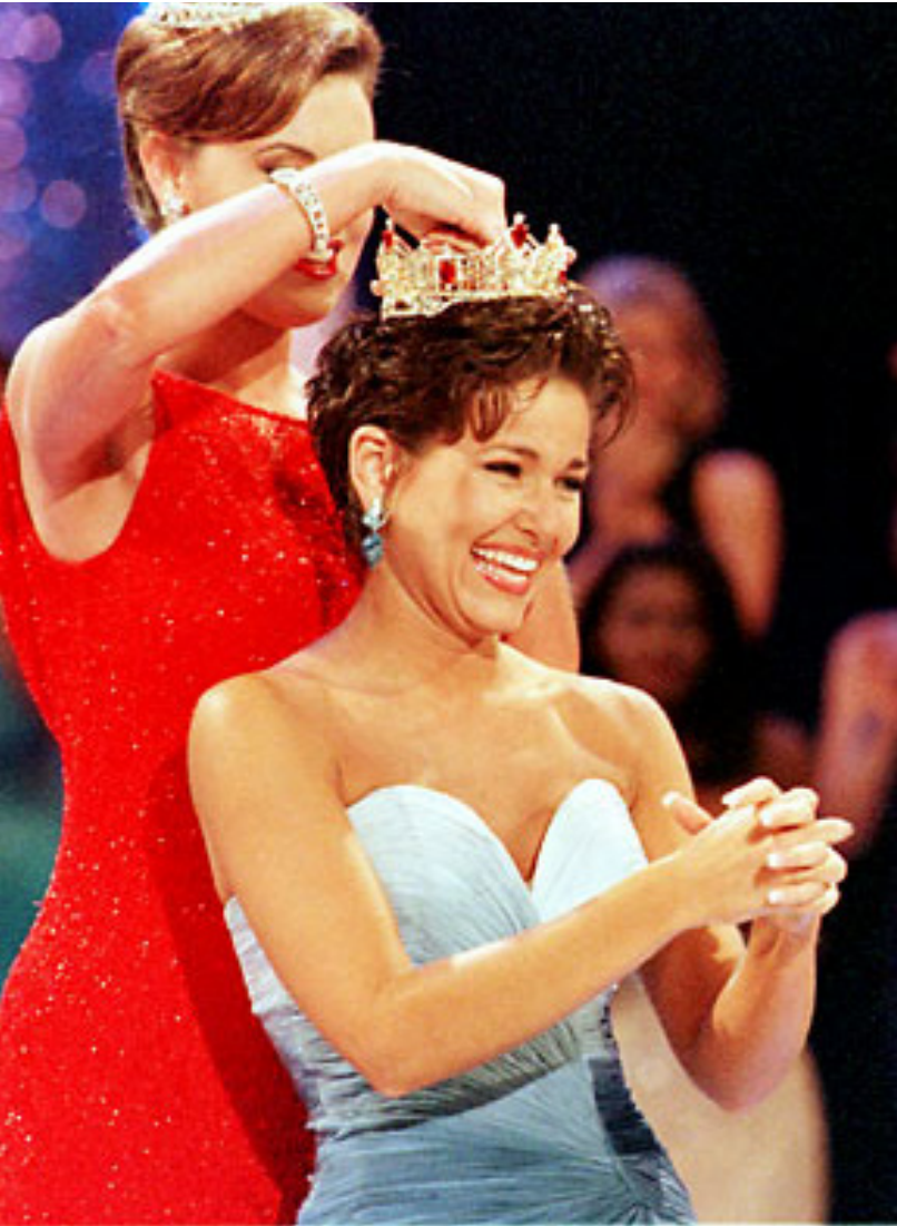
Being crowned Miss America 2000 in Atlantic City, NJ

The KDVA operates with a $70 million annual budget. We serve over 311,000 veterans including 24,000 women veterans. We operate four veterans nursing homes, five veterans cemeteries and over 740 employees statewide. This year, we began a unique focus on female veterans called KY Women Veterans UNITE 2015. We also implemented new programs to work on homeless veterans and benefits. I am honored to be able to serve those who have served our country.