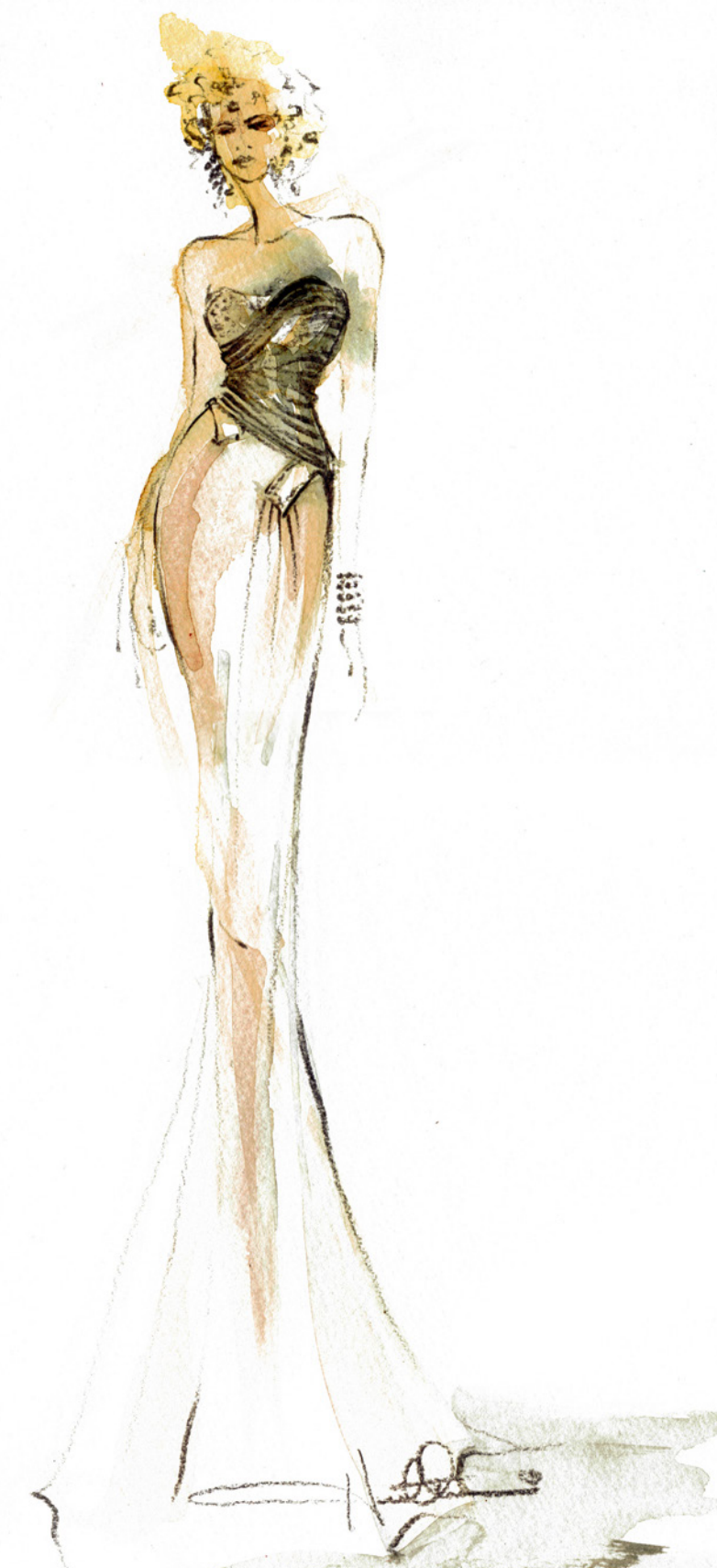
A personal fashion sketch

H: I am blessed that I have many options for my future, however, there is a large amount of pressure for me to run for a political office. I have a great desire one day to be the Governor of the Commonwealth of Kentucky, however, I also have a desire to have another child and at 40, that could be a challenge. I haven't made the decision on my path yet but I will soon.