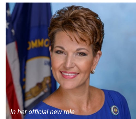
In her official new role