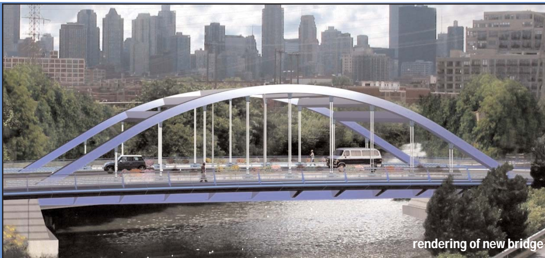
rendering of new bridge