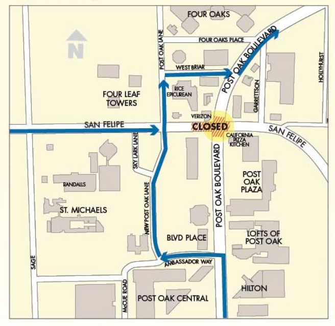
North on Post Oak Boulevard to West Loop