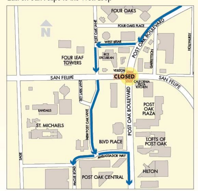
South on Post Oak Boulevard to Westheimer