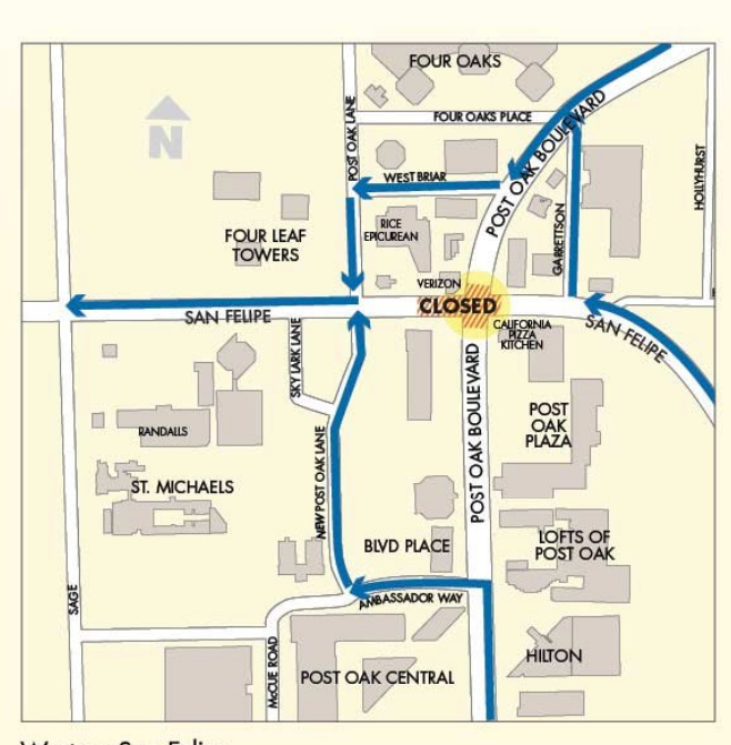
West on San Felipe