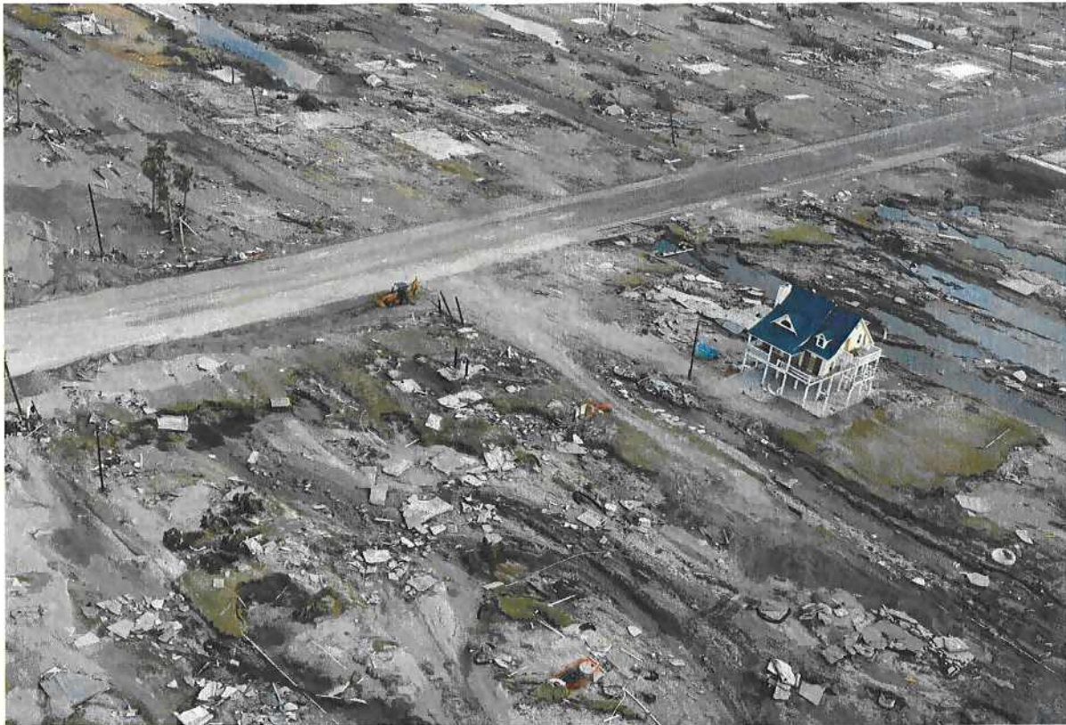
View of the damage Hurricane Ike caused in Gilchrist, Texas in Galveston County.