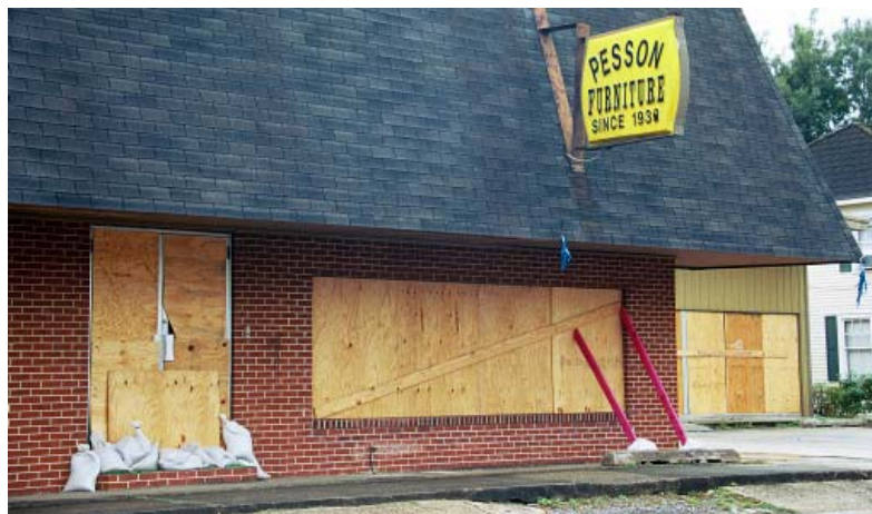
A business is boarded up and sandbags are placed at the base of doors in anticipation of a hurricane.