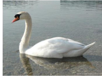
Mute Swan ( Cygnus olor )