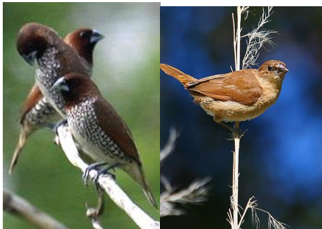
Nutmeg Mannikin: ( Lonchura punctulata ) Adult (L), Immature (R)