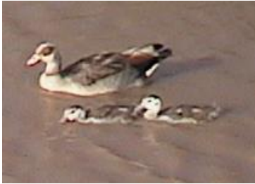
Egyptian Goose ( Alpochen aegyptiacus )