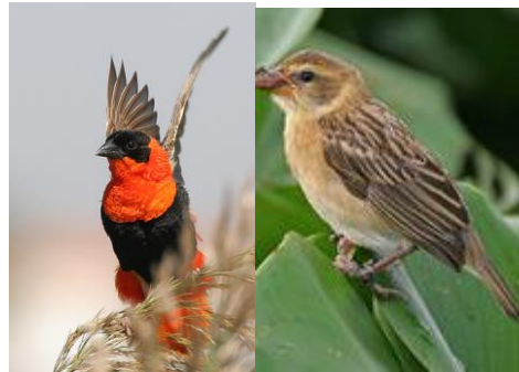
Orange Bishop: ( Euplectes franciscanus ) Breeding M (L), F / Eclipse M / Imm. (R)