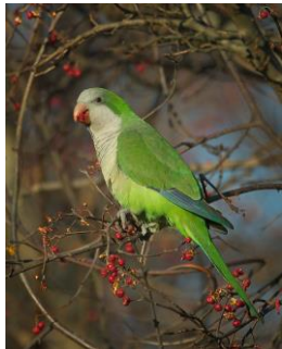
Monk Parakeet ( Myiopsitta monachus )